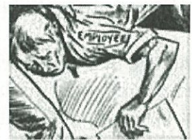
Lamponing the Arbitration Court

The 1935 Labour government extended the arbitration system to cover many more workers, including office workers and government employees. Nationwide unions became legal, and union membership was compulsory – any worker covered by an agreement negotiated by a registered union had to join that union. Union membership increased rapidly under this new system, until nearly half of all workers belonged to a union. Compulsory arbitration was reinstated in 1936. A new Federation of Labour was set up, since the short-lived first Federation had disappeared after the disastrous 1913 Great Strike.