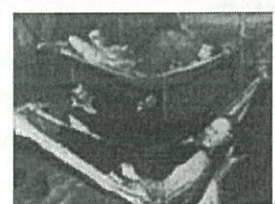
Freezing workers' stay-in strike, 1937