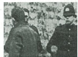
Christchurch tramways strike, 1932