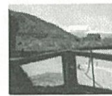
The Hamilton jet boat