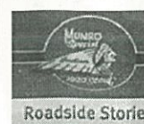
Roadside Stories: Invercargill's inventors