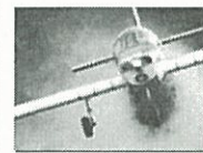
The Fletcher topdressing aircraft (1st of 2)

Before the end of 1949, war-surplus de Havilland Tiger Moths were being converted, with one cockpit transformed into a hopper capable of carrying 272 kilograms of fertiliser. These could fly from hill-country airstrips (rather than aerodromes) or the nearest flat land, reducing the turnaround time for each trip.