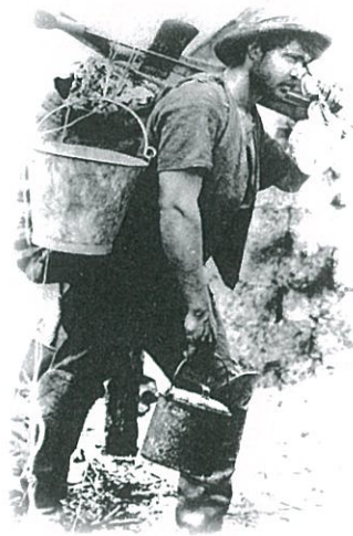
The Kauri Museum, Matakohi

the Liberal Government. In spite of a petition with over 35,000 Maori signing, the movement was unsuccessful, though it did influence the Government’s decision to make changes to land purchasing methods.