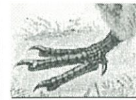
Early European engraving