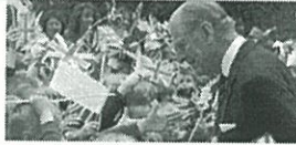
The Duke of Edinburgh