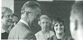
The Prince of Wales

After unveiling a First World War memorial to the Arawas in Rotorua, they visited many North Island towns before arriving in Wellington.