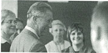
The Prince of Wales