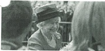
Her Majesty The Queen