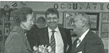
The Princess Royal

Home History of the Monarchy United Kingdom Monarchs