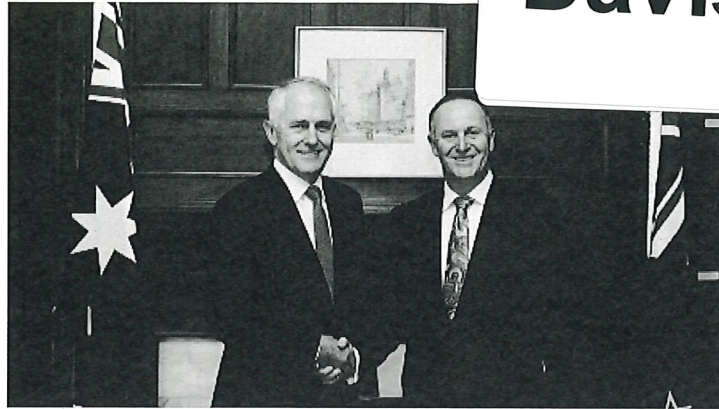
An agreement between Australian Prime Minister Malcolm Turnbull and former Prime Minister John Key which eased the path to citizenship for Kiwi expats has been "gutted", say expats.