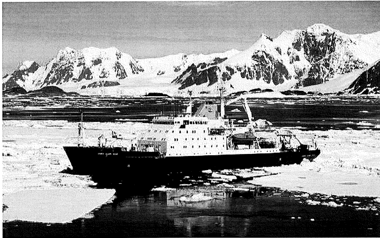
New Zealand has pushed for Ross Sea protection several times.

The new protected area will cover roughly 1.55 million square kilometres, of which 1.12 million square kilometres, 72 percent, will be a no fishing zone.