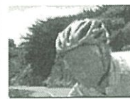
Otago Peninsula community board, 2008