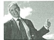
Auckland Council mayor Len Brown