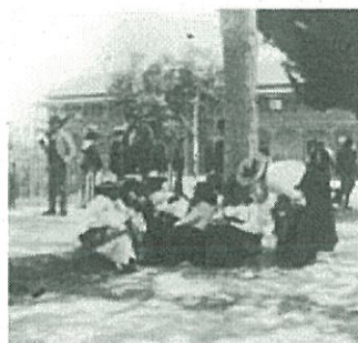
Māori voters in Rotorua. Detail?

The involvement of the indigenous Māori people in New Zealand's electoral system is one of the remarkable stories of New Zealand's political history.