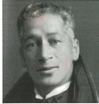
Eruera Tirikatene. Detail?

Read more about these people - and many others - at the Dictionary of New Zealand Biography :