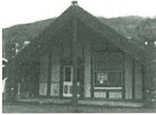
Māori polling booth at Te Whaiti, Urewera. Detail?