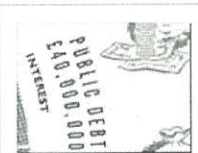
Pay As You Earn pamphlet (1st of 2)