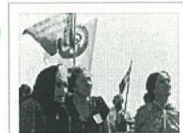
Whina Cooper, Eva Rickard and Titewhai Harawira

The Māori Women's Welfare League was established in 1951 to support Māori in areas such as housing, health and education. The league spread quickly throughout the country, with 300 branches formed within five years. Whina Cooper was the first president, and Mira Szaszy the first secretary. She would later also become president. Both are recognised as outstanding Māori leaders of the 20th century and their championship of the league provided it with a legacy that continued in the 2000s. The league continues to take an interest in contemporary issues for Māori society and inform whānau on issues ranging from cervical screening through to representation roles in governance.