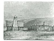
Police stockade, 1849