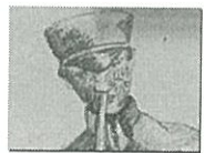
Native constable, 1850