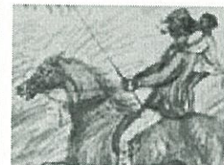
Going to market (1st of 4)

Ngāti Tūwharetoa were given their first horse by Patuone's brother, Tāmami Wāka Nene. Tūwharetoa paramount chief Mananui Te Heuheu named his son Te Waaka after Nene, and sent him to live with Nene in the Hokianga. In 1842 Te Waaka returned to Taupō with a horse Nene had given him, escorted by a large Ngāpuhi party.