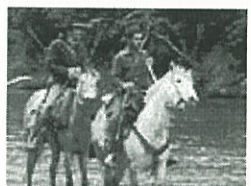
Horse riders in Te Urewera