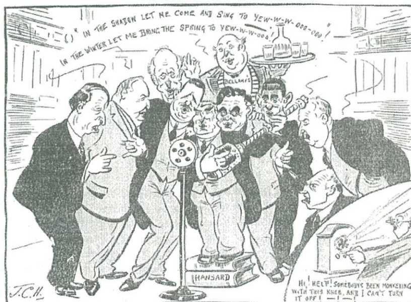
J.C. Hill, Auckland Star, 7 August 1934

The possibility of broadcasting debates in the House arose in 1934. The coalition government was not interested, but cartoonists speculated on the likely effects.