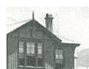
Whakarewa School buildings, Motueka