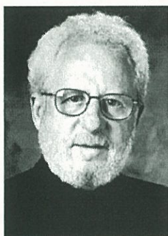
Alan J. Heeger