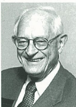
Alan G. MacDiarmid