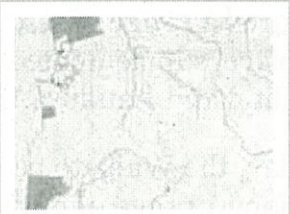
Māori land ownership, 1860 (1st of 2)