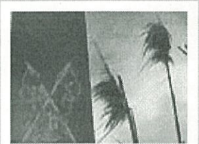
Monument at Ōrākau