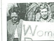
Women's Division protest