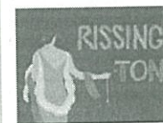
Rissington Women's Institute banner (1st of 2)