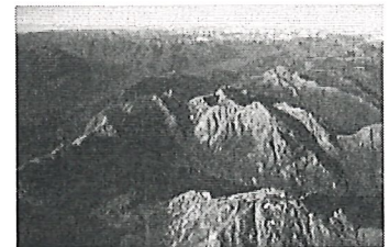
The steep terrain of the Dusky Sound that Henry collected in

Peat, N. (2007) New Zealand's Fiord Heritage: A Guide to the Historic Sites of Coastal Fiordland (Department of Conservation Southland Conservancy).