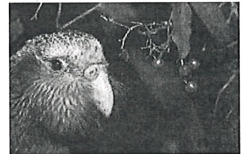
Kakapo eating supplejack berries

Sometimes a single kakapo will represent a hard day's work, and if half-a-dozen are secured, (with a kiwi and a roa), it is considered something of a feat. Once the birds are in portable knapsack cages we then have to deliver the birds to their new home in the best possible condition..."